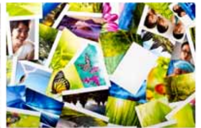
Graphic Art & Photographs

All SmartLF scanners are available in three affordable specification levels; monochrome, color and express color, (m, c, e). m and c models can be easily upgraded via unique Email process if requirements change.