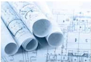
CAD and Technical Drawings

These uniquely versatile scanners capture the sharply defined line detail in technical documents and maps required for AEC, CAD and GIS combined with the highly accurate color reproduction and copying required for graphics and photographic documents – at a price you can afford.