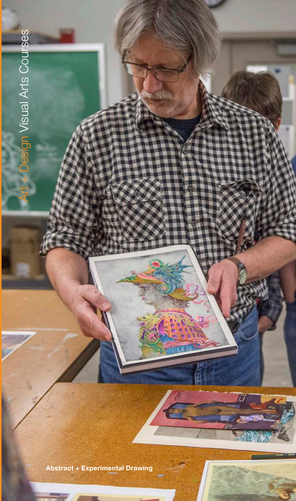
Abstract + Experimental Drawing

Please note: Most adult courses require students to purchase their own supplies ahead of time, and supplies usually cost between $30–50. Supply lists will be shared with enrolled students before the course begins.