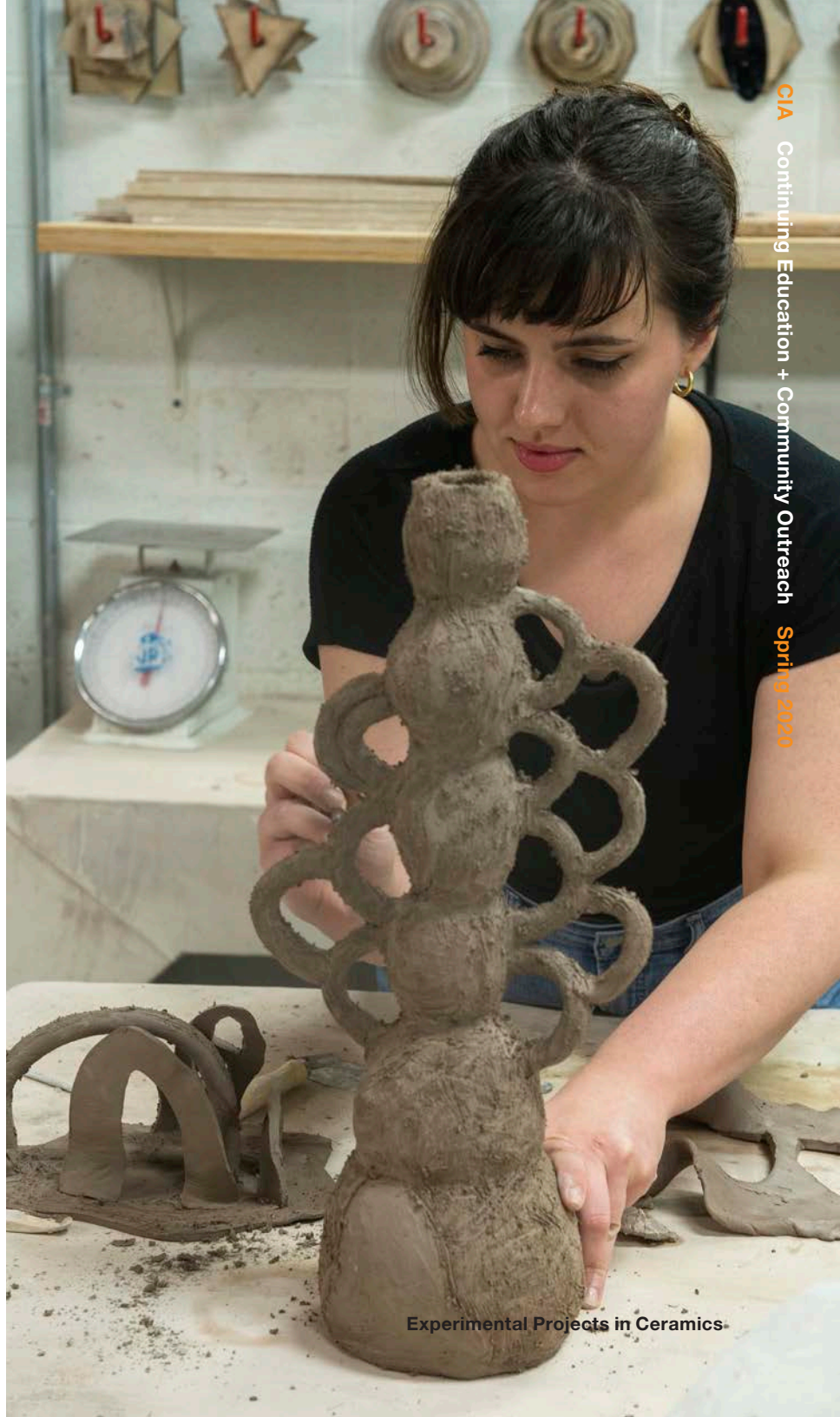
Experimental Projects in Ceramics