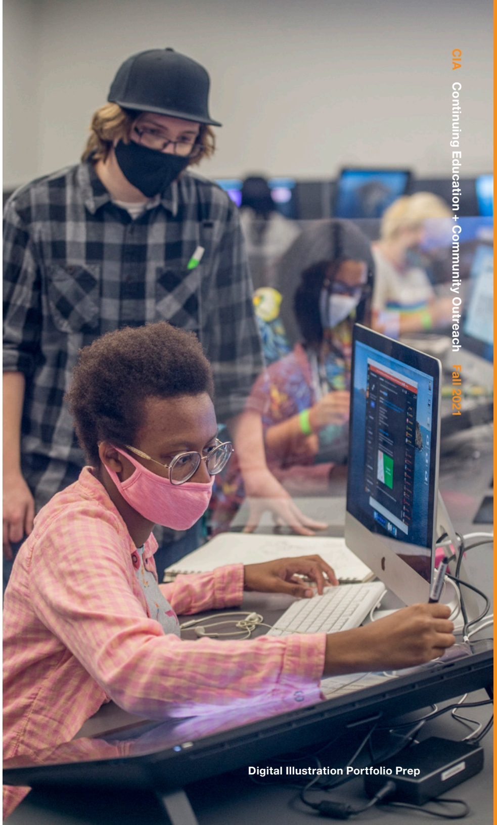
Digital Illustration Portfolio Prep

CIA's Portfolio Class for High School Students provides an opportunity to build or refine a portfolio of creative work, in preparation for the college application process. Working closely with CIA faculty, the course allows students to develop their creative skills and concepts while building a portfolio of creative work that will meet the requirements for a college of art & design. Project prompts will focus on the keys to developing an exceptional Portfolio, with ample opportunity to strengthen creative skills and explore ideas and concepts. Creative projects are augmented by presentations, in-class discussion, and one-on-one feedback. All students are encouraged to use the media/materials that are central to their personal skills and interests.