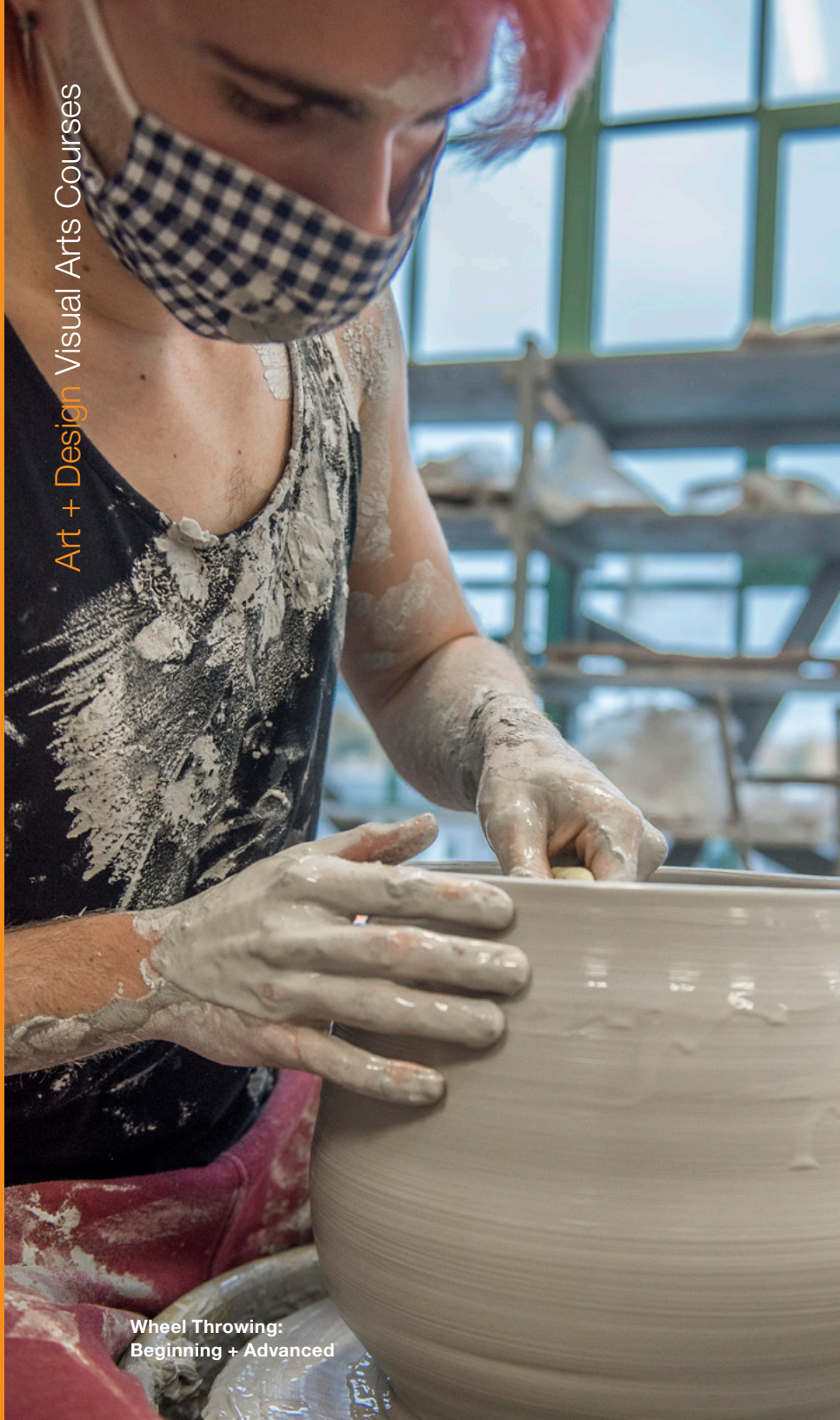
Wheel Throwing: Beginning + Advanced