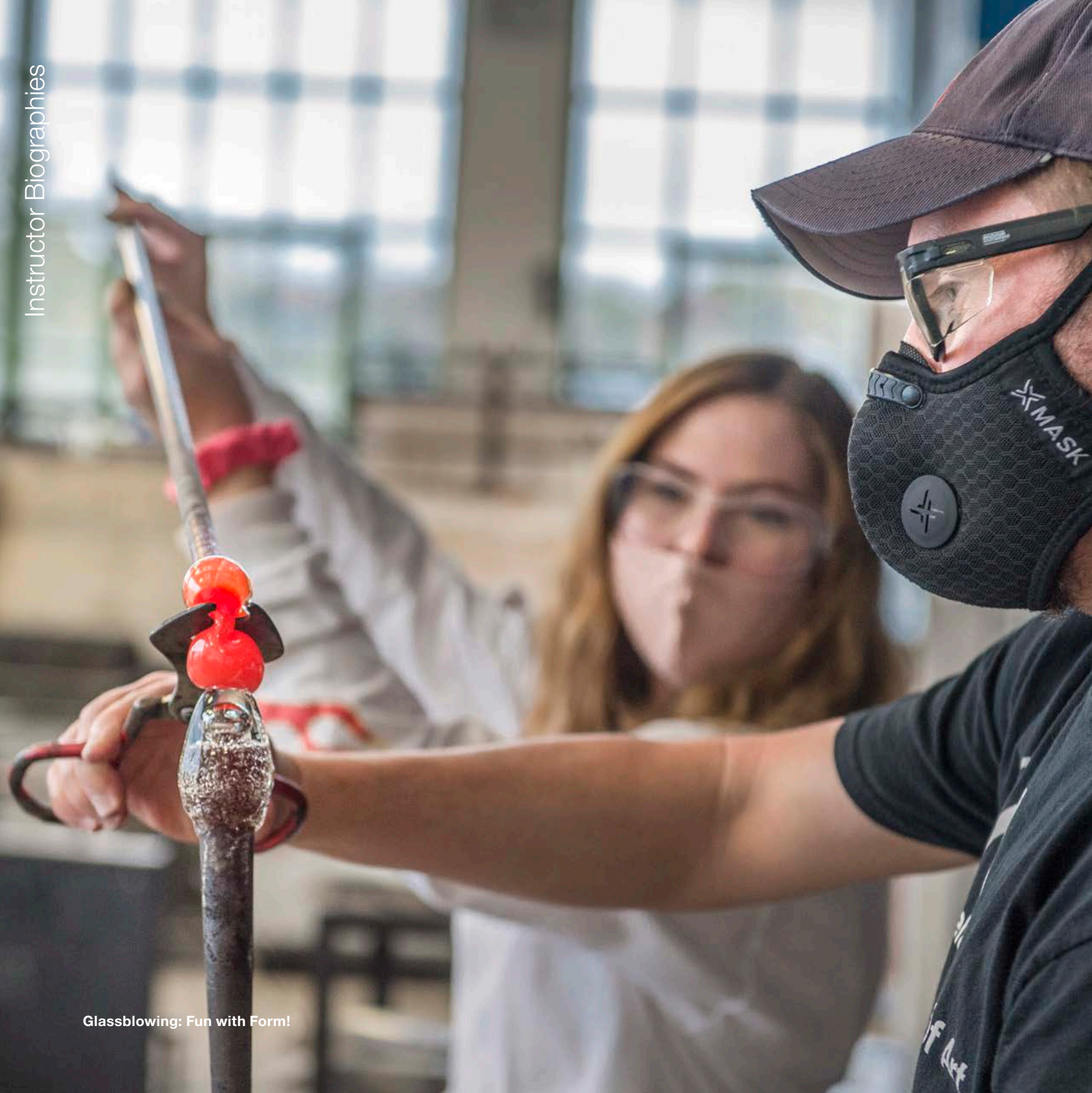
Glassblowing: Fun with Form!