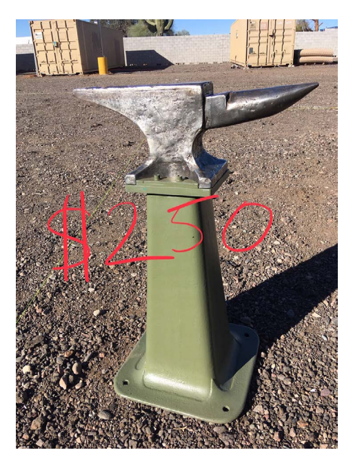
An 80lb anvil and stand I just bought on craigslist for $250. A very nice setup for any blacksmith, including a beginner.

A high-quality 75-100 pound used anvil offers you the best overall value as a novice blacksmith. You can usually find one quickly for around $5 per pound. If you are patient, you can even find one for $1-$3 per pound. This means that you can pick up a used 75-pound anvil for between $200 and $500. Ebay tends to have the highest prices, while your best bet for scoring a deal is craigslist, OfferUp, or most of all, word of mouth.