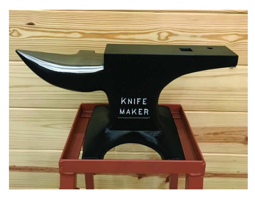
NC's 76-pound Knife Maker anvil is a great option at $310.

There are a lot of great new anvils on the market, too. The 76-pound Knife Maker anvil at $310 is an excellent choice. For those with a higher budget, below I've also included a list of other new anvils ranging from $400 to just over $1000.