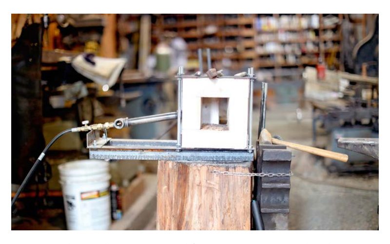
A propane forge will cost you around $200, or you can easily build your own.

If you prefer to purchase a forge, you're still only looking at a modest investment of around $180 for a used forge or $229 for a new one.