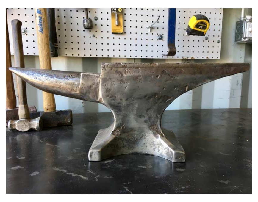
This anvil was purchased for less than $250 by setting an alert on craigslist and then acting quickly once it was posted.